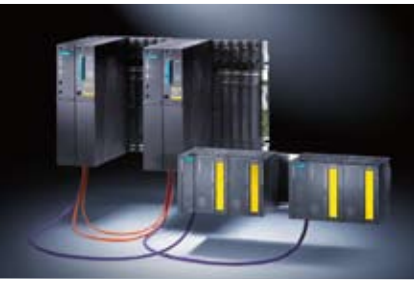
SIMATIC automation system S7-400