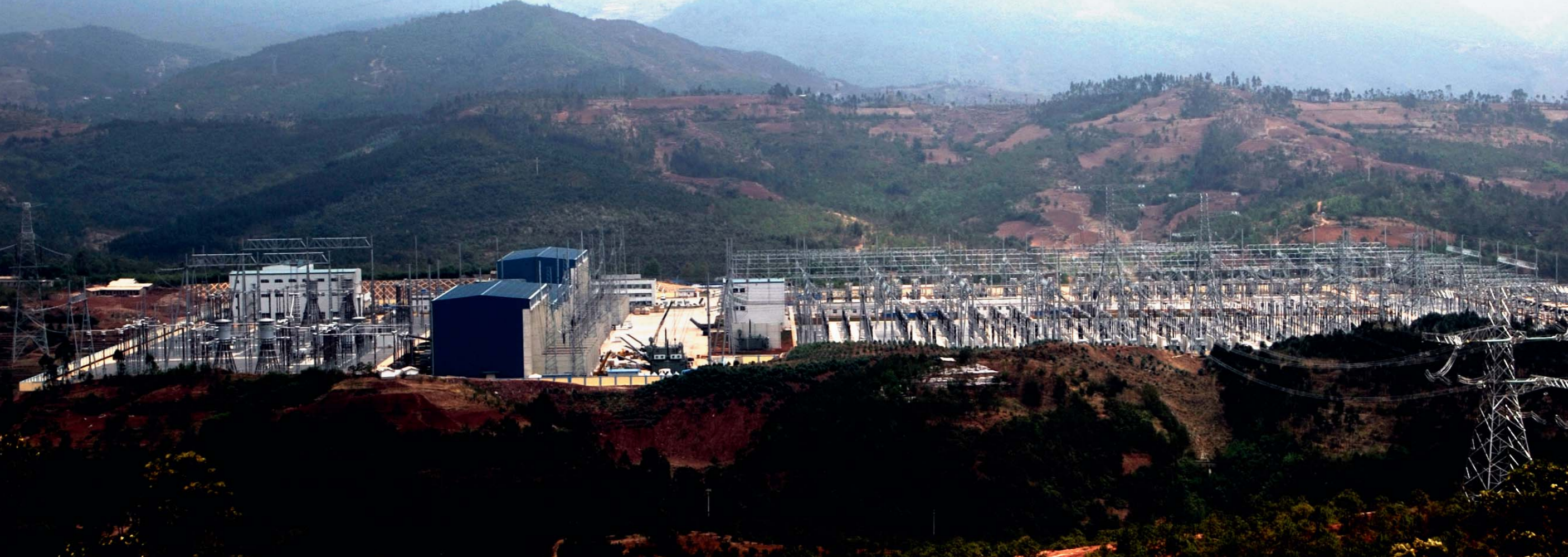
The Chuxiong Substation – the DC yard is situated in the left part of the installation.

Most people, even in China, have never heard of Chuxiong Prefecture. Its chief city, also called Chuxiong, has a mere 130,000 inhabitants, almost a village by Chinese standards. The next city – Kunming, the provincial capital of Yunnan – is nearly 200 kilometers away. From the perspective of the highly urbanized east and south of the country, from megacities such as Beijing, Guangzhou, and Shanghai, Yunnan Province in southwest China is a remote, almost mythical place. Artists from Beijing who have had enough of city life sometimes go there to get in touch with nature. Yunnan is famous in China for its tea plantations, for its ancient cities such as Dali – exotic even for Chinese travelers –, and for its marvelous alpine landscapes. Chuxiong town is enclosed by mountain ranges in a plateau region at an altitude of roughly 2,000 meters. This is where the Chuxiong hydro-power plant is located, which feeds the