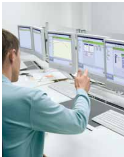
Charge eMosphere software suite