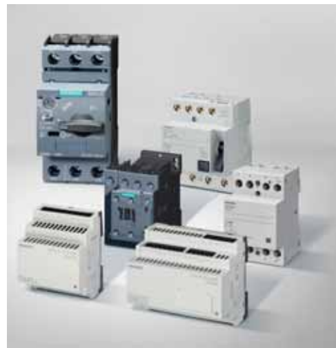
Charging infrastructure components