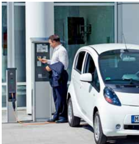
Sittraffic EPOS-P AC satellite system