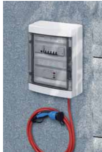
Charge WB100A AC wall box

More information: www.siemens.com/drivergy