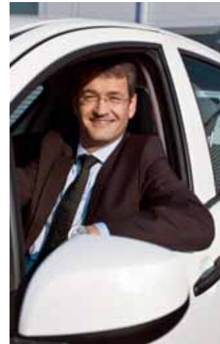
Charge CP500AAC charging point