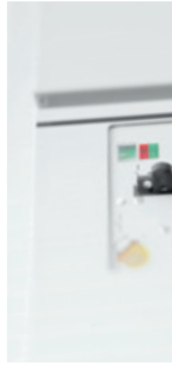
8DH10 switchgear up to 24 kV, up to 20 kA, up to 1,250 A up to 17.5 kV, up to 25 kA, up to 1,250 A