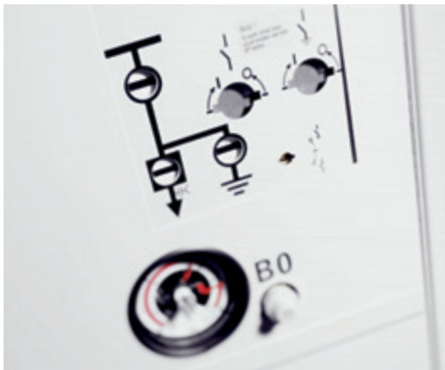
8DA10 switchgear up to 40.5 kV, up to 40 kA, up to 5,000 A