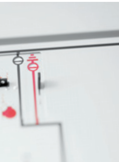
NXPLUS C switchgear up to 24 kV, up to 25 kA, up to 2,500 A up to 15 kV, up to 31.5 kA, up to 2,500 A