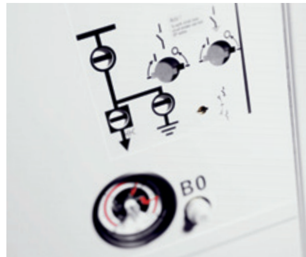
Switchgear for wind turbines: NXPLUS C Wind 36 kV, up to 25 kA, up to 1,000 A