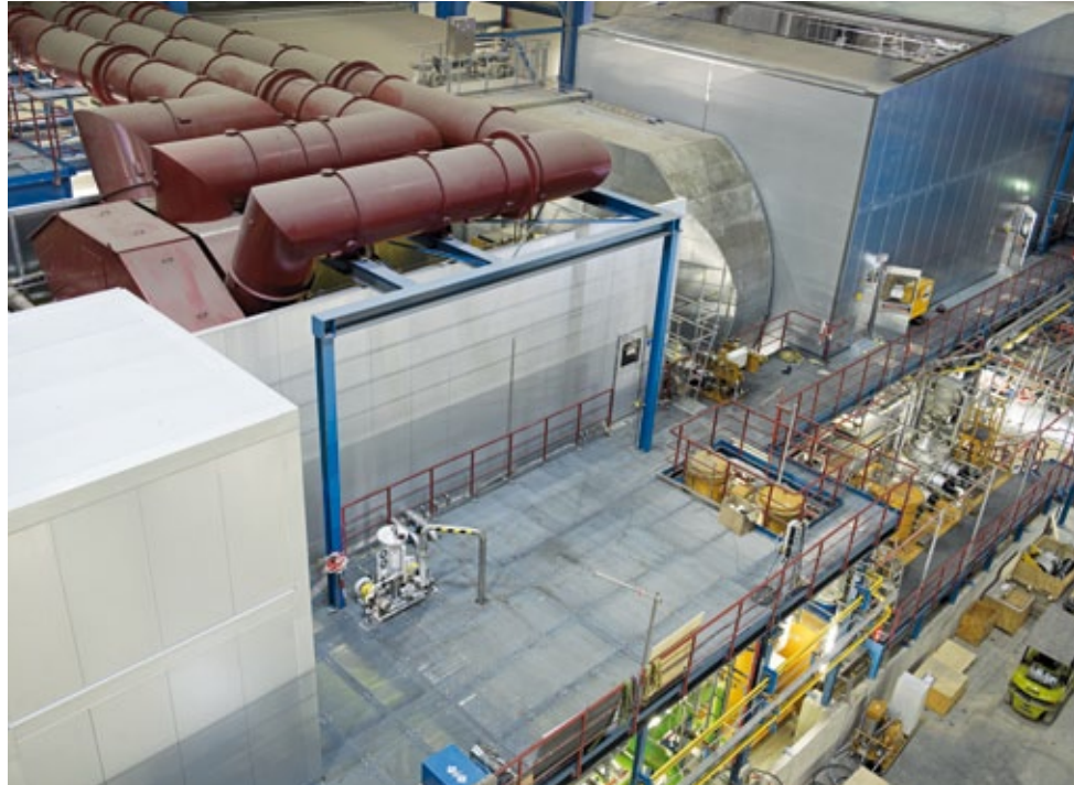
SGen5-3000W at Ulrich Hartmann Combined Cycle Power Plant in Irsching (Bavaria, Germany)

SGen-3000W series with ratings from 600 up to 1,270 MVA