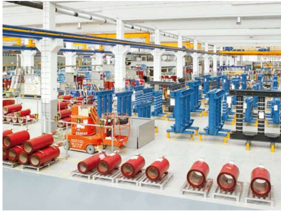
Maximum efficiency in use and economic production: the new GEAFFOL Basic.