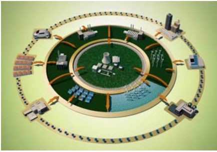
Figure 2: The vision of the smart grid

Building smart grids is a highly complex task which includes