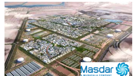
Figure 4: Illustration of Masdar City