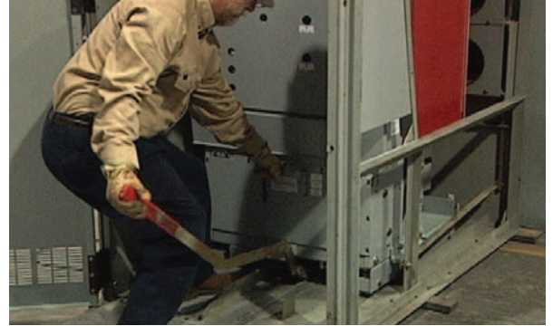
Before: Original floor-mounted lever racking, commonly used on type D and F switchgear, required the operator to stand in front of the breaker with the panel door open.

For more information or to receive a video explaining the field modification, please contact your local Siemens PT&D sales representative or contact (800) 347-6659 regarding your site-specific application.