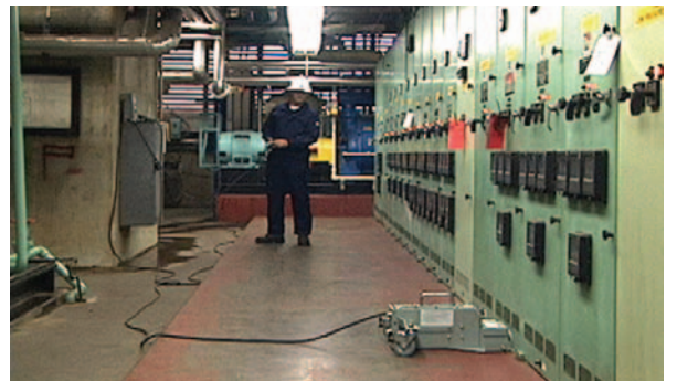
After: Following the field modification, the breaker can be racked in and out while the operator stands outside of the arc flash zone.