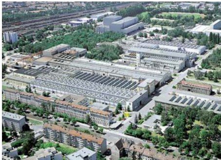
Traction Transformer Plants: Nuremberg, Germany (Center of Competence)