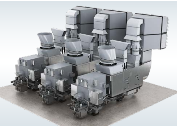
Power generation package for flexible, efficient offshore power