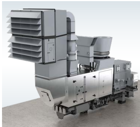
Offshore package with single-lift capability and high availability