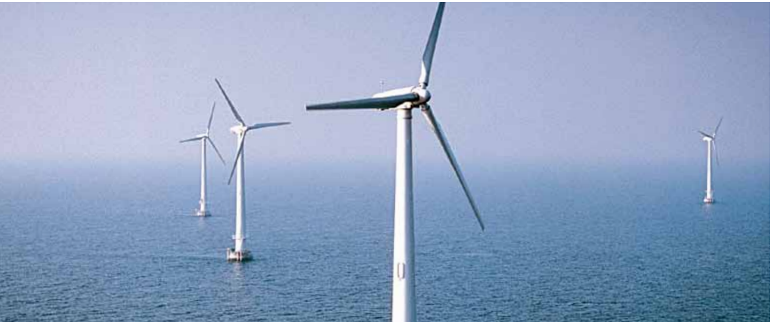
The world's first wind farm at Vindeby, Denmark. Installed by Siemens in 1991. The turbines in this project are still running today