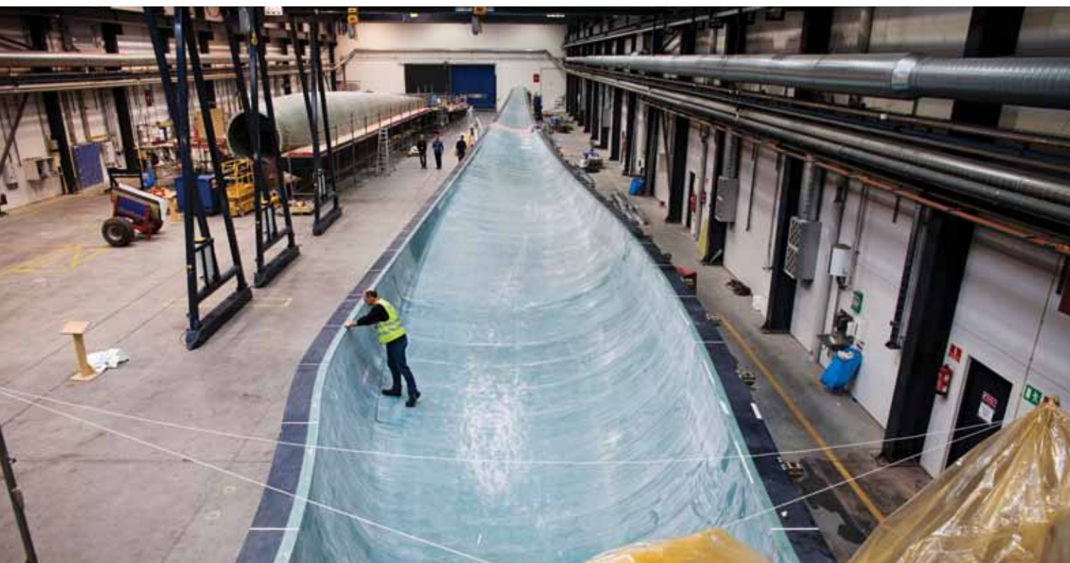
Mould for the B75 Quantum Blade